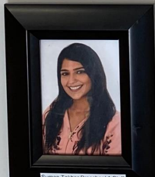
Suman Takhar Preschool 1 Staff