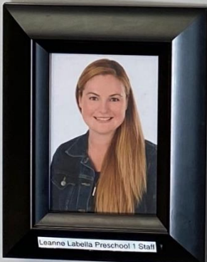
Leanne Labela Preschool 1 Staff